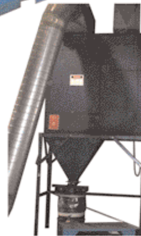
Torit Dust Collector